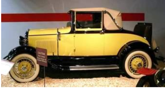
'29 Cabriolet (file copy from internet)

My only problem was that I only had about $50 at that time and my mother did not want me to have any kind of car because my grades were very poor and she felt that a car would be the end of my high school education. My father didn't see it quite that way but as always he backed up my mother.