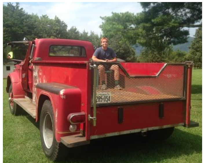
Boonsboro's Biggest "Baddest" Pick-up Truck