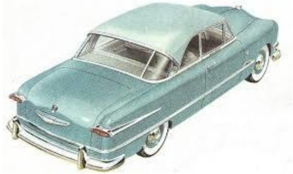
1951 Ford ("shoebox") Victoria

Lynchburg Region, AACA 1006 Tumbleweed Lane, Bedford, VA 24523