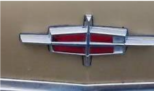
1979 Lincoln trunk ornament

As of this writing, we are packing, checking over the car, and getting ready to head to Florida for a week with the Buzzard Breath Region . Sorry to miss the Natural Bridge Tour, but the Florida tour has been planned for a year.