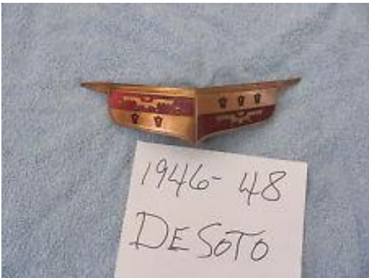
Desoto hood badge