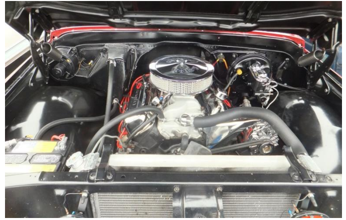
Owen Burks' BIG block 396, Chevy C 10.

Unfortunately I don't have any pictures to share with you of the above events.