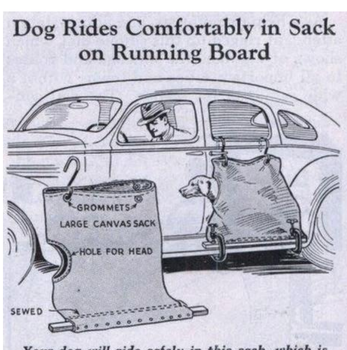
Your dog will ride safely in this sack, which is quickly attached or removed

When you take your dog along for a ride, but prefer not having it inside the car, it can ride safely and comfortably in this sack, which is carried on the running board. The bottom of the sack is clamped to the running board and the top is fastened to the lower part of an open window with hooks, covered with small rubber tubing to prevent marring the car.