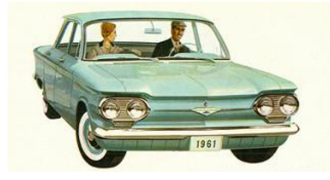
Safest car in the USA!

When you take your dog along for a ride, but prefer not having it inside the car, it can ride safely and comfortably in this sack, which is carried on the running board. The bottom of the sack is clamped to the running board and the top is fastened to the lower part of an open window with hooks, covered with small rubber tubing to prevent marring the car.