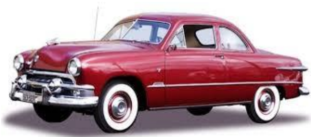
1951 Ford Club Coupe "shoe-box". (File copy)