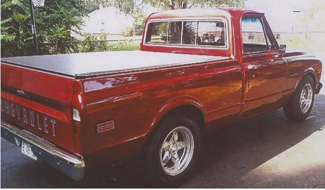
Owen Burks' "big block" 1971 C10