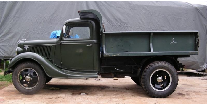
Reggie Goolsby's 1936 Ford 1 1/2 Ton Dump