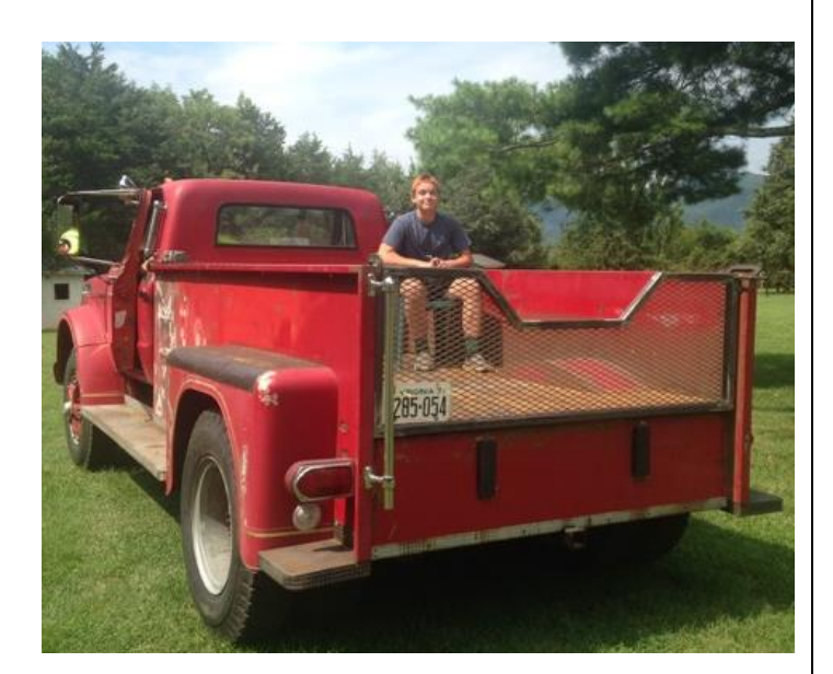
Boonsboro's Biggest "Baddest" Pick-up Truck